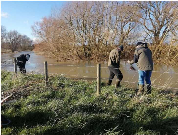
Figure 4 PDAA volunteers planting trees