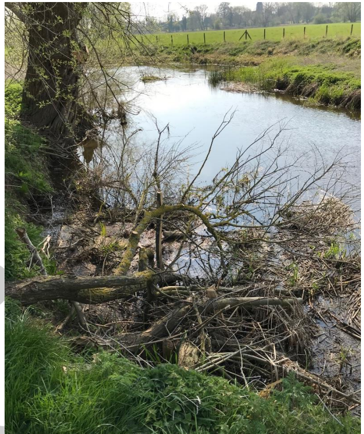
Figure 2 Hinging and pinning of a smaller tree at Ailsworth

Cut limbs were held between pairs of hardwood stakes, and then secured with short loops of plain fencing wire attached to the stakes with staples. The loops of wire were independent from each other, so if one fails, the whole structure will not. Wire loops were twisted tight and the stakes driven down further to securely hold down the limbs in place. Post tops and surplus wire were trimmed to length. For added security, particularly if the hinge was to fail, in addition to the wire bindings, the limbs were drilled through and secured using lengths of steel cable shackled to double hardwood stakes driven deep in the riverbank using a mechanical (compressed air) post driver. Also, on the basis of advance maintenance, where trees have already collapsed, they were pulled against the bank and secured in situ, to ensure that they do not wash away in high flows and create a blockage downstream.