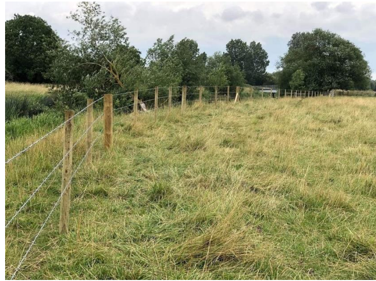
Figure 5 New fence line at Ailsworth backchannel