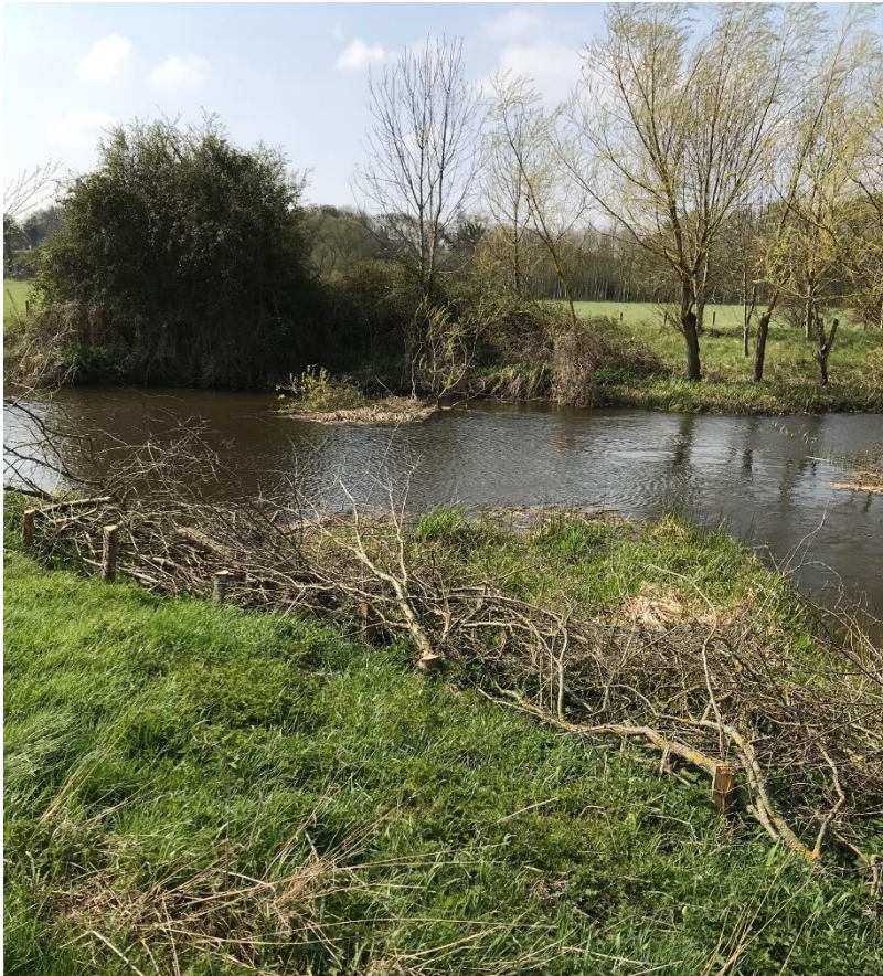
Figure 3 Brash mattress blocking off the Nursery swim