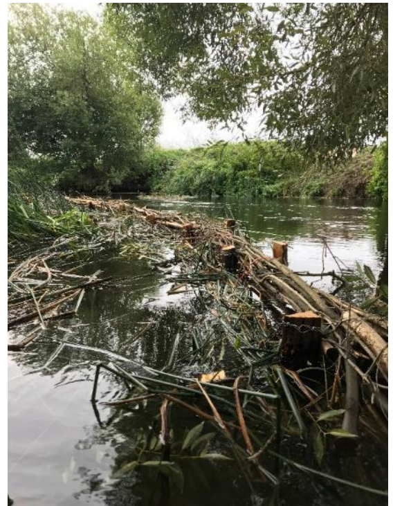
Figure 5 Faggot bundle revetment mid-channel to deflect flow

Two wooden sculptures were also installed in the country park. One was sculpted in the shape of a Pike and the other was sculpted in the shape of a Chub. Both of these fish species are native to the river informing the community in an innovative way that although they might not see the fish in the river, they are there. Figures 6 and 7 show the wooden sculptures after they were completed.