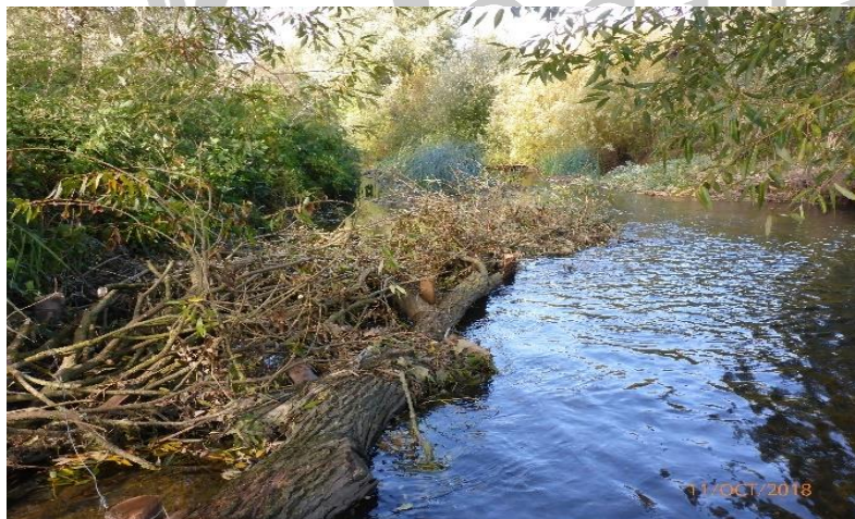
Figure 4 A large hinged and pinned tree

This is where large limbs or whole small trees have a notch cut into the base of the trunk (a hinge) and are dropped on to the bank or into the water in a controlled way before being pinned into the bank using hardwood stakes and heavy-duty wire. This technique was carried out fifteen times across the back channel to increase woody habitat, providing refuge for juvenile fish such as Chub and invertebrates as well as birds and mammals throughout the year. Figure 5 shows one of the fifteen trees that were hinged and pinned across the back channel.