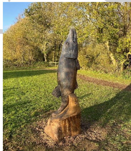
Figure 7 Pike sculpture near the upstream end of the project