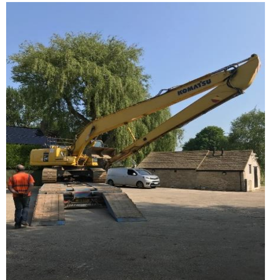
Figure 3 4– 20m long reach excavator for placing the gravel in the channel

160 tonnes of gravel was deposited over three locations along the backchannel. The aim of this was to alter the speed and direction of the water flow creating a range of habitats within the backchannel. The size of the gravel introduced ranged from 4-40mm in size. This is important because gaps are created within the gravel which allows oxygenated water to flow through it, creating good habitat for invertebrates and for fish spawning. The range of gravel size also helps the gravel bed to hold together during flood conditions to minimise movement. Figure 4 shows the excavator which was used to place the gravel into the backchannel.