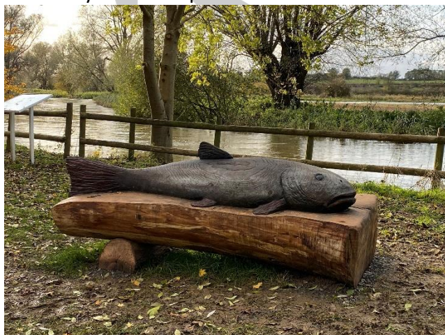
Figure 6 Chub Bench at the downstream end of the restored section