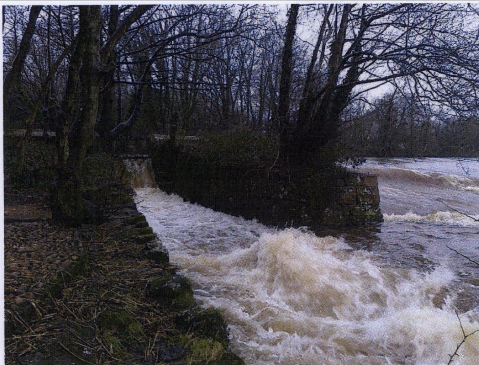
Figure 1: Proposed turbine location - draindown sluice channel in high flow