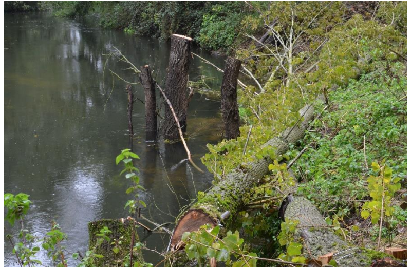
Figure 2 – Secured limbs on the bankface extending on to the channel

The trunks of trees were partially cut at the base, leaving a narrow bark and sapwood hinge, and then bent horizontally (pointing downstream) along the bank to create a tangle of twigs and branches extending to no more than 10-15% of the channel width. Cut limbs were held between pairs of hardwood stakes, and then secured with short loops of plain fencing wire attached to the stakes with staples. The loops of wire were independent from each other, so if one fails, the whole structure will not. Wire loops were twisted tight and the stakes driven down further to securely hold