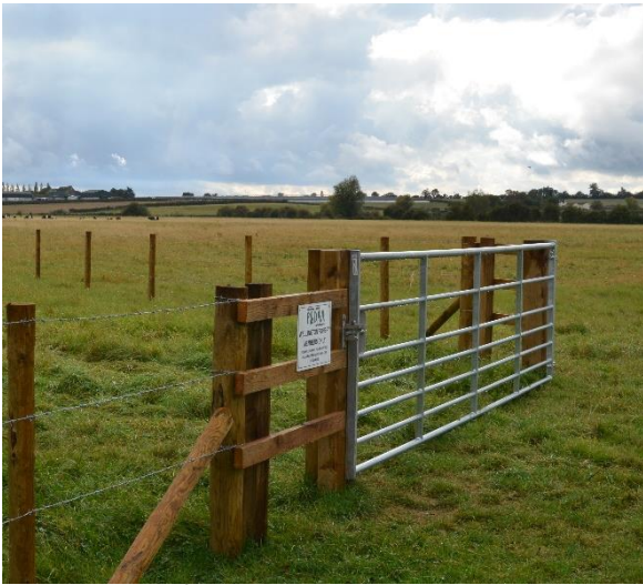
Figure 5 - Access gate on the new fence line