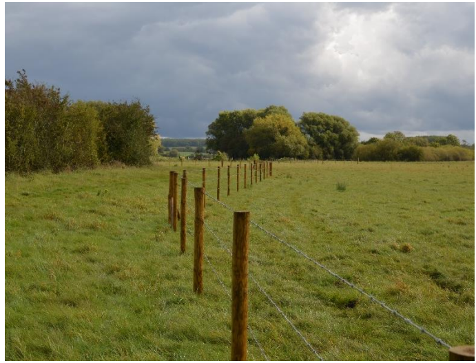
Figure 6 - New fence line at Nassington backchannel

With the new fence line creating much more space between the bank edge and the fence, the local angling club now have much better access to be able to fish on this section of the backchannel. Previously it had been tricky with the original fence line leaving very little room to fish, as well as not having access points on it.