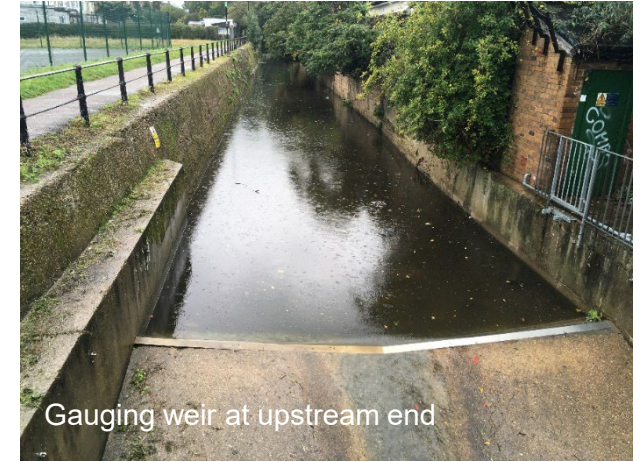
Gauging weir at upstream end