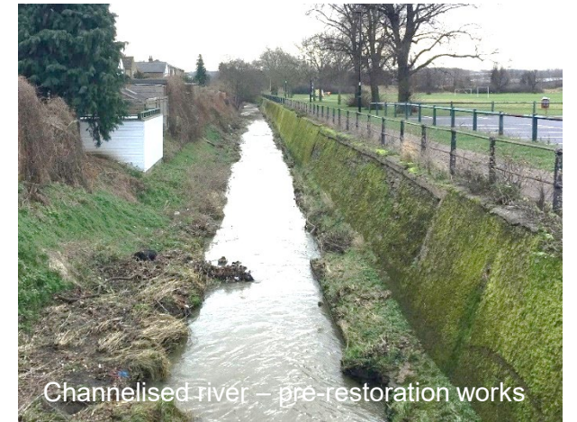
Channelised river – pre-restoration works