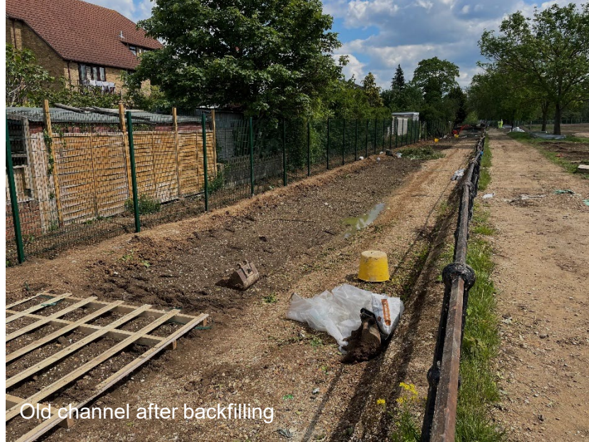
Old channel after backfilling