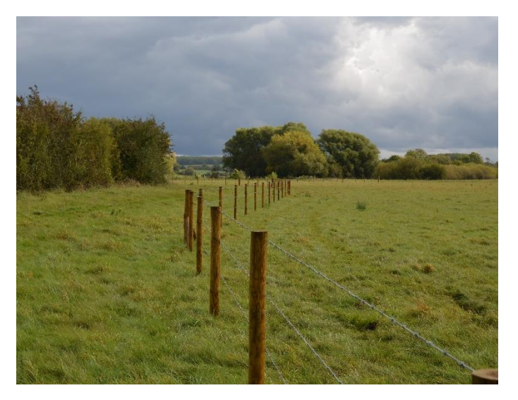
Figure 6 - New fence line at Nassington backchannel

With the new fence line creating much more space between the bank edge and the fence, the local angling club now have much better access to be able to fish on this section of the backchannel. Previously it had been tricky with the original fence line leaving very little room to fish, as well as not having access points on it.