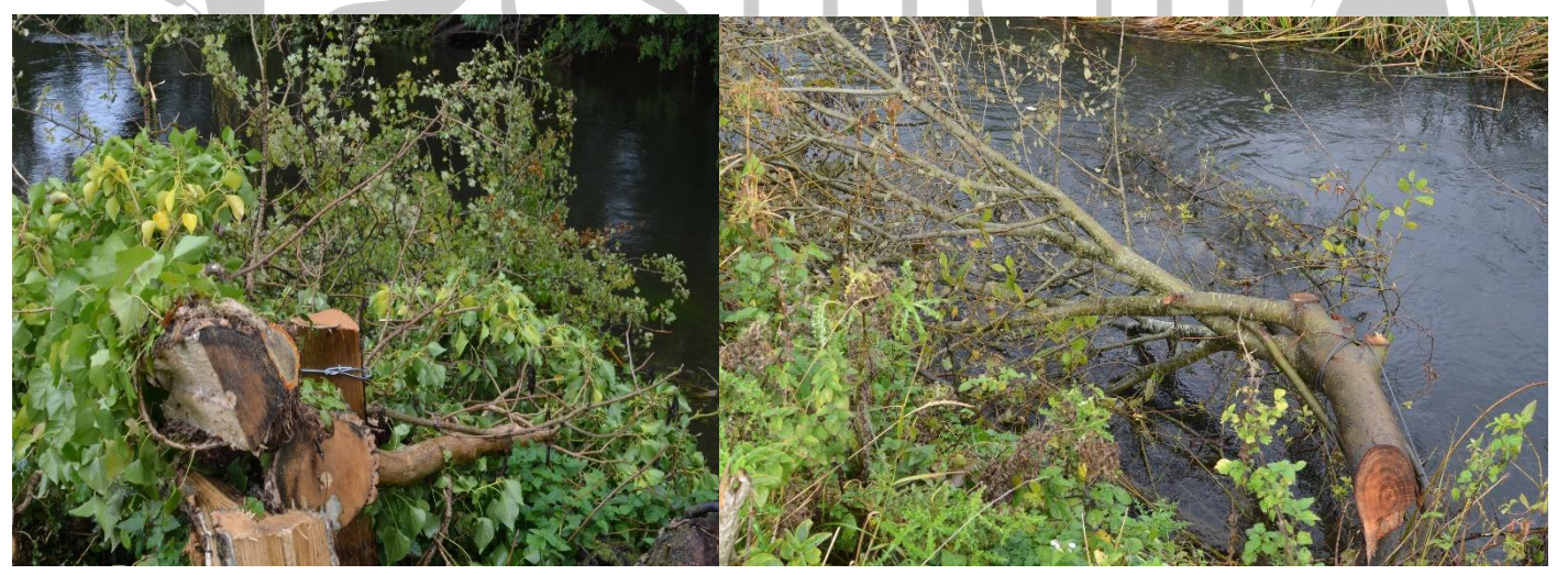
Figures 3 & 4 – Smaller hinged and pinned trees extending in to the channel

down the limbs in place. Post tops and surplus wire were trimmed to length. For added security, particularly if the hinge was to fail, in addition to the wire bindings, the limbs were drilled through and secured using lengths of steel cable shackled to double hardwood stakes driven deep in the riverbank using a mechanical (compressed air) post driver. Also, on the basis of advance maintenance, where trees have already collapsed, they were pulled against the bank and secured in situ, to ensure that they do not wash away in high flows and create a blockage downstream.