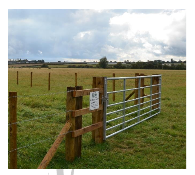
Figure 5 - Access gate on the new fence line