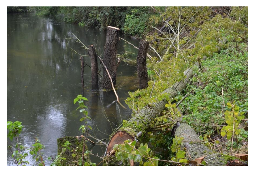
Figure 2 – Secured limbs on the bankface extending on to the channel

The trunks of trees were partially cut at the base, leaving a narrow bark and sapwood hinge, and then bent horizontally (pointing downstream) along the bank to create a tangle of twigs and branches extending to no more than 10-15% of the channel width. Cut limbs were held between pairs of hardwood stakes, and then secured with short loops of plain fencing wire attached to the stakes with staples. The loops of wire were independent from each other, so if one fails, the whole structure will not. Wire loops were twisted tight and the stakes driven down further to securely hold