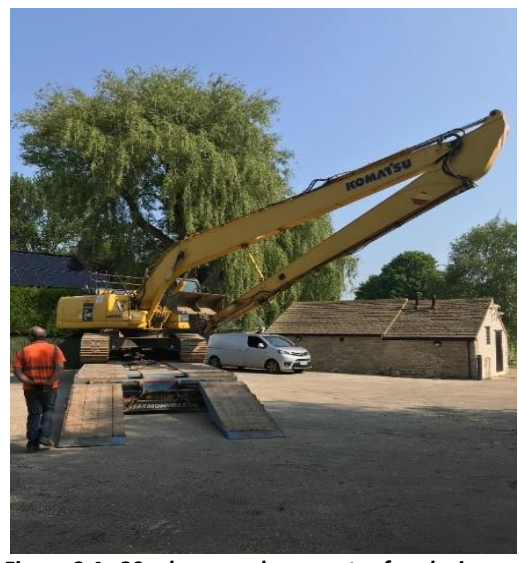
Figure 3 4-20m long reach excavator for placing the gravel in the channel

160 tonnes of gravel was deposited over three locations along the backchannel. The aim of this was to alter the speed and direction of the water flow creating a range of habitats within the backchannel. The size of the gravel introduced ranged from 4-40mm in size. This is important because gaps are created within the gravel which allows oxygenated water to flow through it, creating good habitat for invertebrates and for fish spawning. The range of gravel size also helps the gravel bed to hold together during flood conditions to minimise movement. Figure 4 shows the excavator which was used to place the gravel into the backchannel.