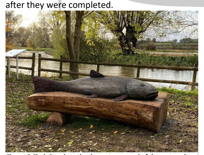
Figure 6 Chub Bench at the downstream end of the restored section

park. One was sculpted in the shape of a Pike and the other was sculpted in the shape of a Chub. Both of these fish species are native to the river informing the community in an innovative way that although they might not see the fish in the river, they are there. Figures 6 and 7 show the wooden sculptures