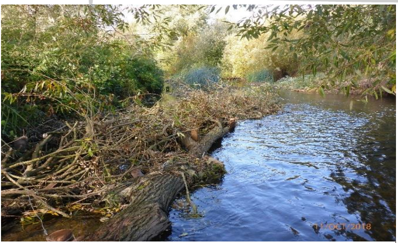
Figure 4 A large hinged and pinnned tree

This is where large limbs or whole small trees have a notch cut into the base of the trunk (a hinge) and are dropped on to the bank or into the water in a controlled way before being pinned into the bank using hardwood stakes and heavy-duty wire. This technique was carried out fifteen times across the back channel to increase woody habitat, providing refuge for juvenile fish such as Chub and invertebrates as well as birds and mammals throughout the year. Figure 5 shows one of the fifteen trees that were hinged and pinned across the back channel.