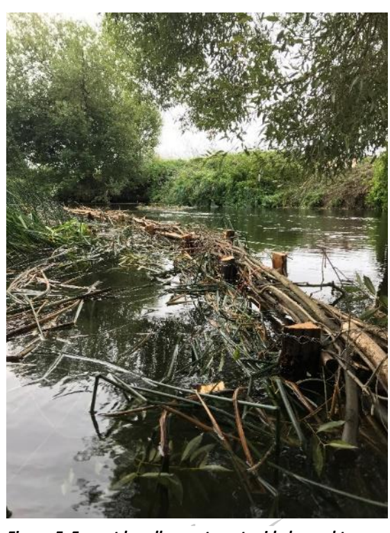
Figure 5 Faggot bundle revetment mid-channel to deflect flow

Native British trees such as hawthorn, elder, blackthorn, hazel and dog rose were planted along the riverbanks in a number of locations. These trees will create vital shade once matured, keeping the water cooler and slowing reed and weed growth in the channel.