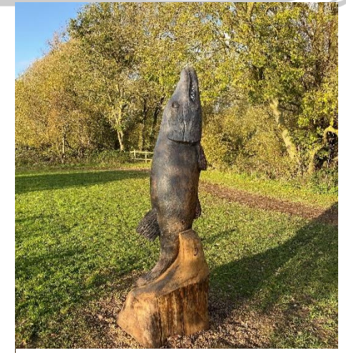
Figure 7 Pike sculpture near the upstream end of the project