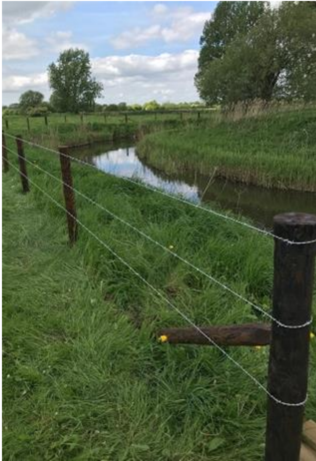
Figure 4 New fencing installed at Elton

the ford were erected and access gates were installed to prevent cattle access. Overall, over 600 metres of fencing was erected.