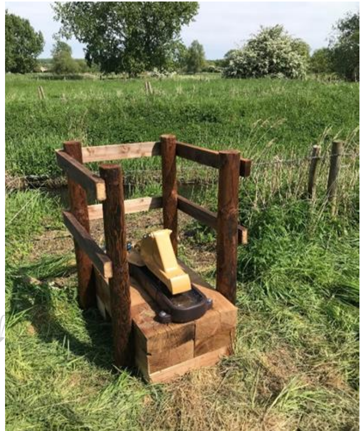
Figure 5 One of three pasture pumps installed at Elton