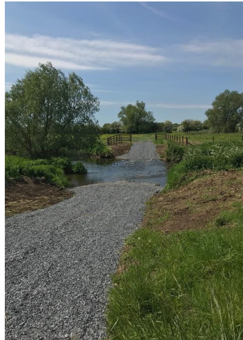
Figure 3 Elton ford after the works had been completed