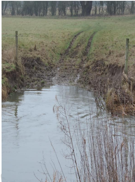
Figure 2 Elton ford prior to this project