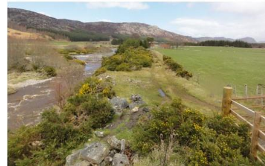
Study sub-reach D

River right embankment to remain to retain track access to Bridgend, although reprofiled on river side.