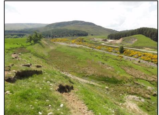
Study sub-reach C