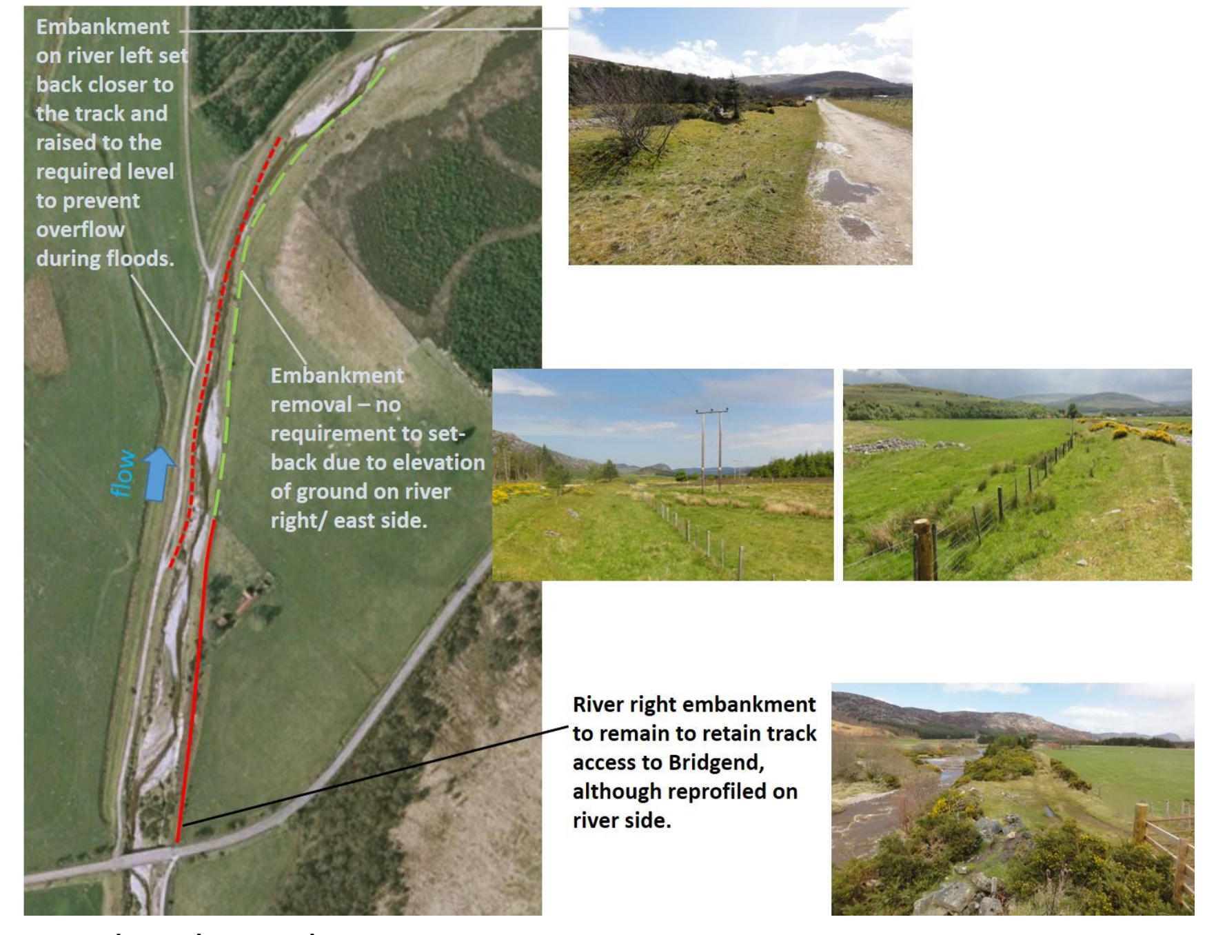
Study sub-reach D